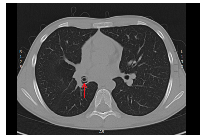
Figure 2. Thoracic computed tomography revealing annular shade in the intermediate bronchus of the right lung (red arrow)

Based on the symptoms described above and the results of additional tests, FBA was suspected and it was decided to deepen the interview with the patient and his parents. The mother strongly denied the possibility of foreign body aspiration, while the boy remembered that four months ago at school, while he was holding a pen in the mouth ending with a rubber eraser, he had an attack of strong coughing, after which the eraser 'went missing'. As a result, on the same day rigid bronchoscopy was performed and the foreign body