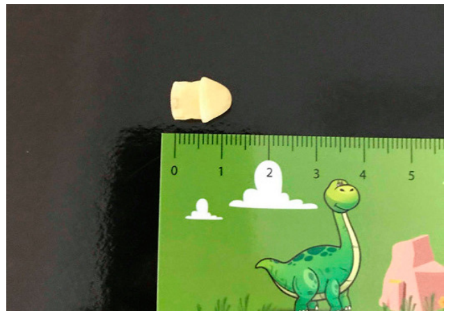
Figure 3. Foreign body (eraser) removed from the intermediate right lung bronchi

removed from the intermediate right lung bronchi (Fig. 3). Today, the child is in good condition, asymptomatic and without further symptoms of pneumonia.